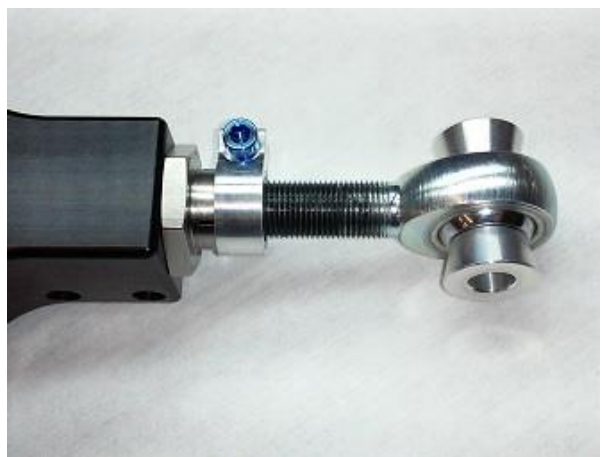
Overextended rod end.